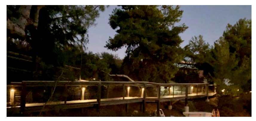
Amphitheater Bridge at an Evening Event