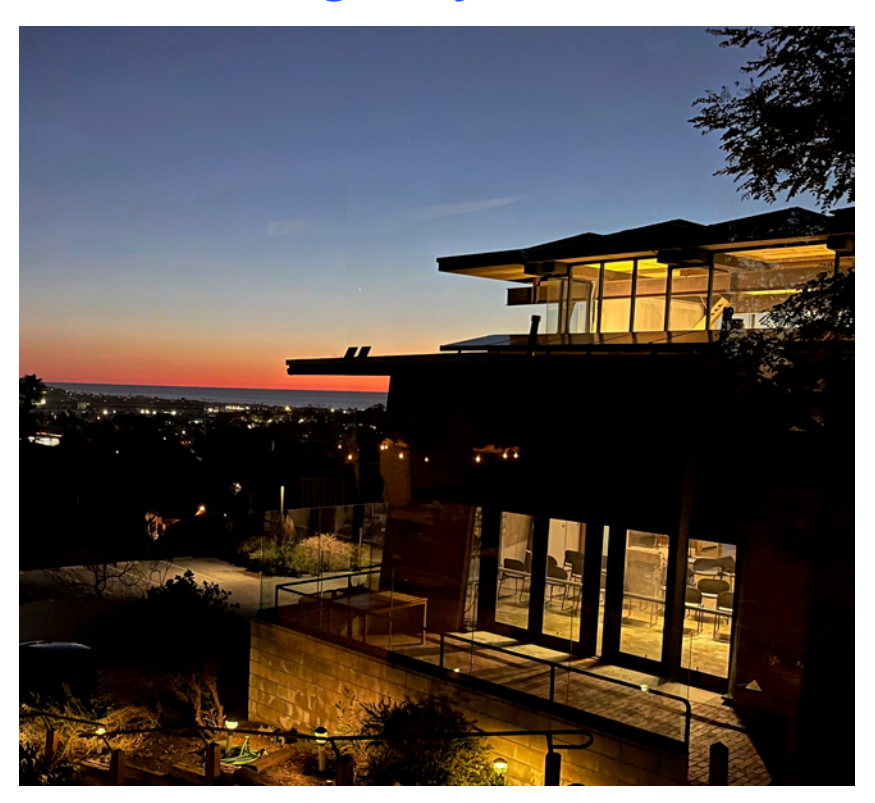
A View From the UUFSD Palmer Library

Published by the Unitarian Universalist Fellowship of San Dieguito in order to promote love, growth, and right relations both locally and globally.