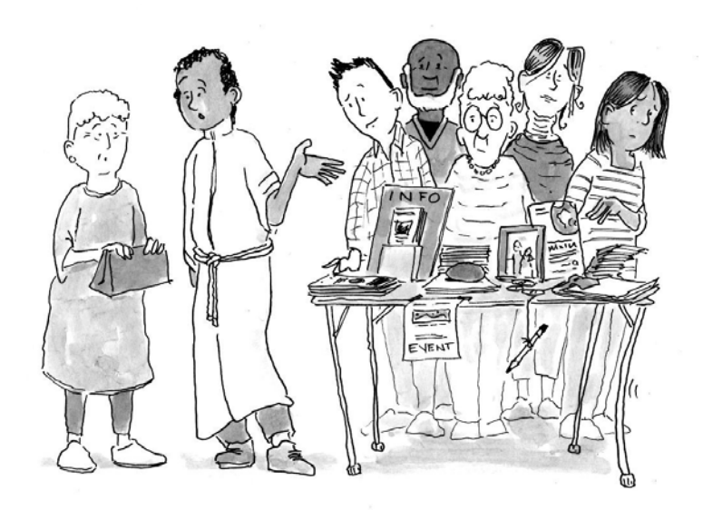
"Here we have the Feed-the-Hungry Committee, the Green-Earth Committee, The Fellowship Committee, and the Purchase-Another-Card-Table Committee,"