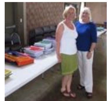
Co-Chair Backpack Project