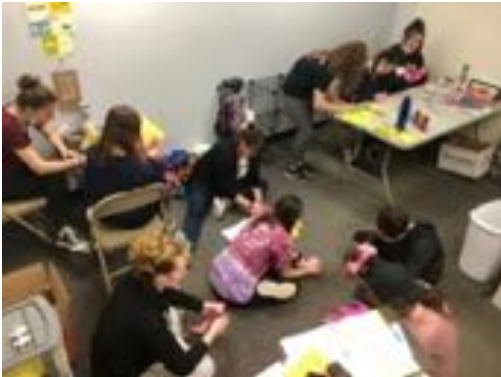
SDRRN Shelter, San Diego