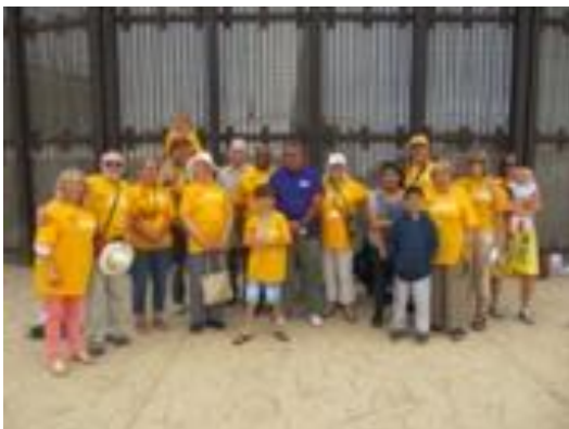
UUFSD Bearing Witness at the Border

UU'S are bearing witness to the victimization of migrants coming into the US lawfully. We all want to help to welcome them to the US and alleviate their suffering. Individuals in our congregations are already volunteering in a number of ways at the Shelter, making their voices heard at the Board of Supervisor's meetings, helping those who are being detained and deported by ICE, and financially supporting the ACLU and Jewish Family Services and other organizations doing much needed advocacy and direct service.