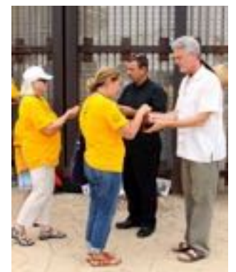
Bearing Witness at the Border