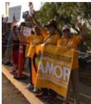
Keep Families Together