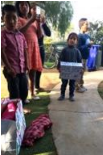
Christmas Celebration with our Three Guatemalan Families

Our UUFSD Fellowship has been assisting three families, six adults and eight children, who are living in Encinitas and seeking asylum.