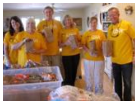
Day Laborer's Lunch Program