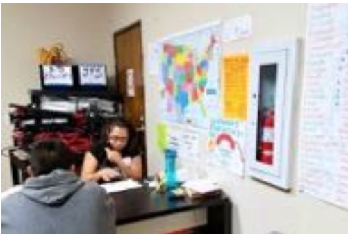
SDRRN Shelter, San Diego