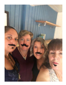
First Staff Meeting of FY 2017-18,

Behold our dedicated UUFSD staff welcoming in the new FY with dignity and purpose.