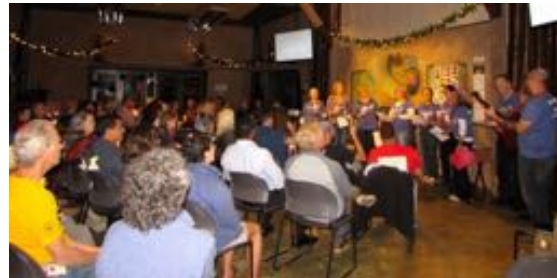
Peace and Freedom Singers